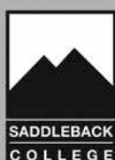
Norman Weston - Composition and Theory www.saddleback.edu/fa/music-composition