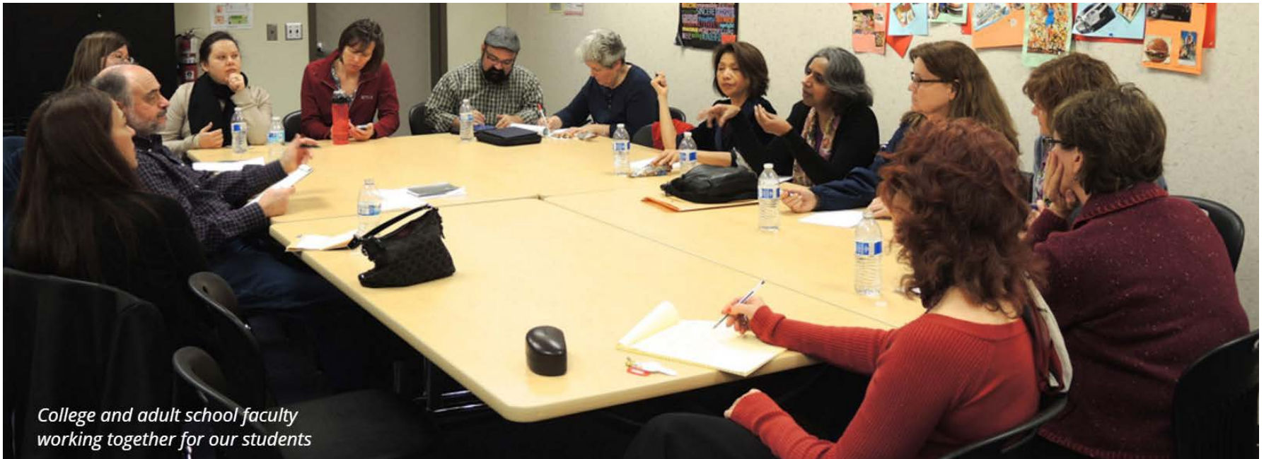
College and adult school faculty working together for our students