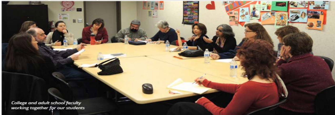
College and adult school faculty working together for our students