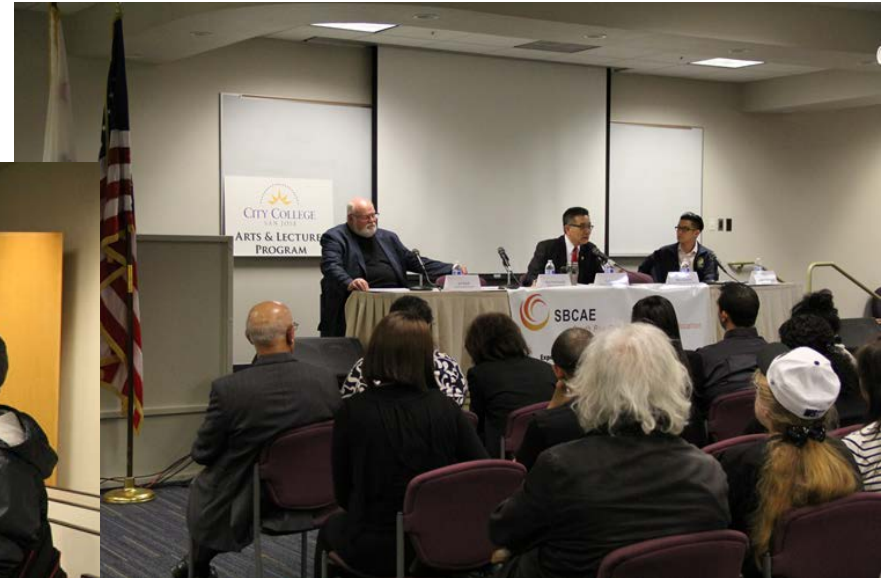
Community Forum, March 5, 2015