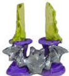
Bat Candles ($24)