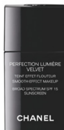
Chanel Perfection Lumiere Velvet Foundation SPF 15