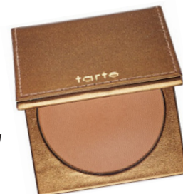
Tarte Amazonian Clay Matte Waterproof Bronzer