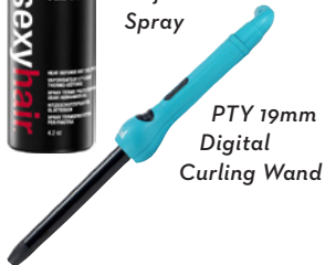
PTY 19mm Digital Curling Wand

Loose “ undone ” soft curls are a perfect look for summer— stylish, but not fussy. To achieve easy, beach-inspired waves apply your favorite heat protectant through your strands and a misting of hairspray to help hold your style. Brush through product before dividing your hair into sections no wider than 1”, wrap hair away from your face around a vertical curling wand, held inverted so the top points down. Hold for a 10 count and let the curl fall from the wand, letting the curl cool in your hand for extra staying power. After you’ve curled and worked your way around your head, curling either all or a selection of hair, rake your fingers through the curls to break and loosen them up— the messier the better- for a look that is carefree and chic .