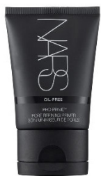
NARS Pro-Time Pore Refining Oil Free Primer

It goes without saying that strenuous makeup routines go right out the window as the temperatures rise, so the look for Summer is lighter and very natural looking . This look can be achieved with great products that let your true beauty illuminate with added SPF to protect your skin. Start with a primer to refine pores and reduce shine, then apply a foundation with a natural coverage and a matte finish to beat the heat. For an added touch of color also use a matte bronzer without shimmer to keep the look natural. For your legs and body, try a bronzing lotion for an instant glow that washes off at the end of the night without the commitment of self-tanner.