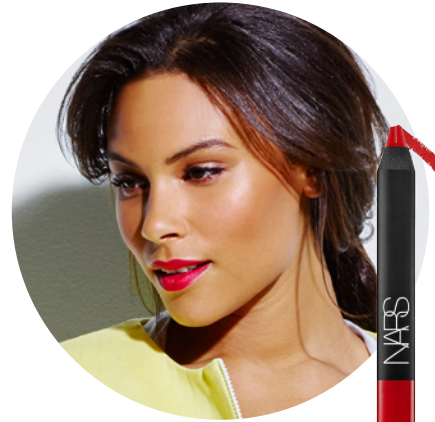
Nars Velvet Matte Lip Pencil