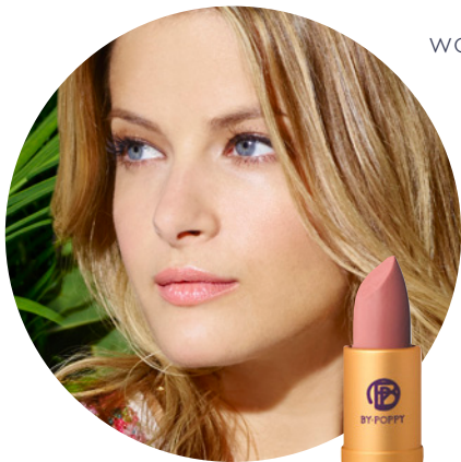
Lipstick Queen Saint Lipstick in Pinky Nude

A matte red lip is all the rage this season and looks striking balanced with more naturally inspired makeup. However, if you’re a gloss devotee, no fear, choose a pinky nude that will also update your “naturally gorgeous” look for the season.