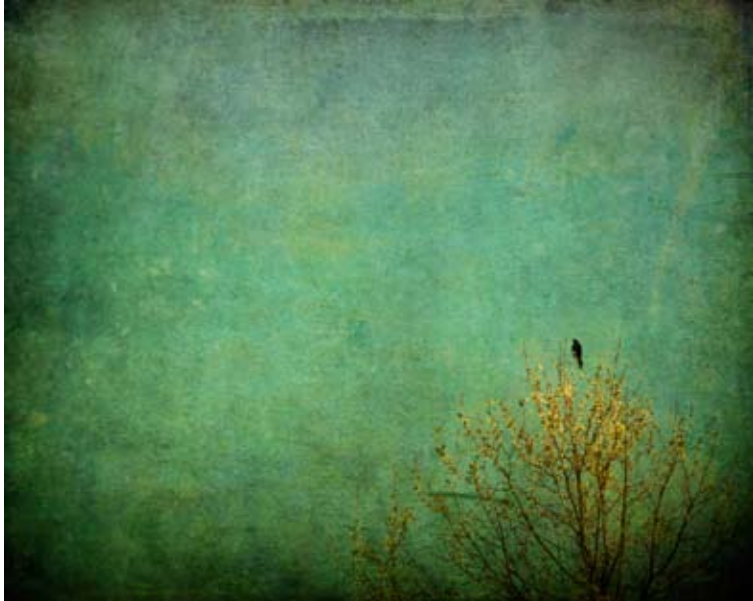
Untitled Tricia McKellar www.triciamckellar.com

Sometimes the world feels inhospitable. You feel all the ways that you and it don't fit. You see what's missing, how it all could be different.