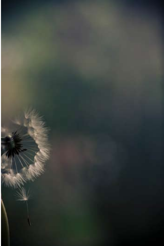
Letting Go of 2009 Tracey Clark www.traceyclark.com

Even in the struggle, you are loved. You are being loved not in spite of the hardship, but through it. The thing you see as wrenching, intolerable, life's attack on you, is an expression of love.