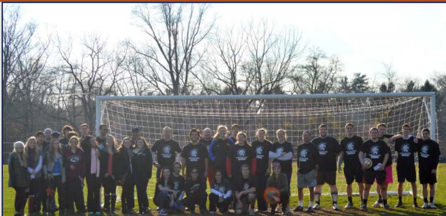
2015 Alumni Day Soccer Game & Tailgate

FIND THE LATEST ALUMNI NEWS AT WWW.WOODLYNDE.ORG/ALUMNI