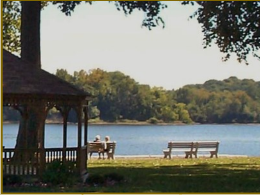
Park benches along the river at Henry Hudson Park

What better way to remember a loved one ~ or ~ celebrate a special event than to plant a tree ~ or ~ place a bench in a public park for all to enjoy for years to come!