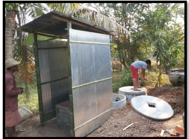
The construction activity and Photos at site and family.