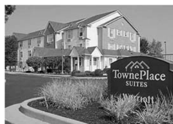
TownePlace Suites by Marriott 8468 Union Chapel Rd Indianapolis, IN 800.619.3224 $129