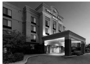
Marriott SpringHill Suites 11855 N. Meridian St. Carmel, IN 317.846.1800 $115

If you require an overnight stay, contact one of the facilities below to reserve a room at a discounted rate. The Ritz Charles does not have sleeping rooms. NOTE: You must mention ASCLS-CLMA and reserve by August 22, 2015 to receive the discounted rate while these rooms are available.