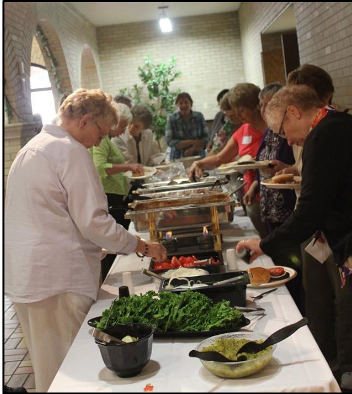
Sisters ate together and continued their meeting