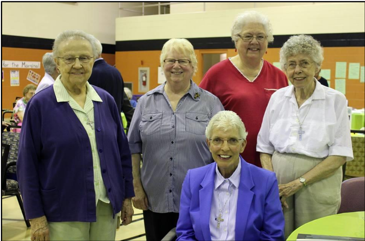
Sisters gathered in groups of four and five to listen, reflect, and discuss their direction for their future.