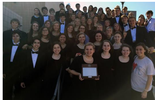
The Lads & Lassies