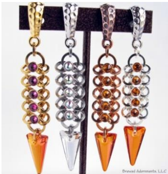
Fishbone Pendant & Earrings

***Important*** There will be a required kit fee for this class! It will include ALL materials to complete the project.