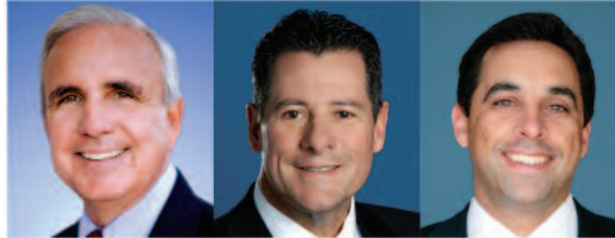
Mayor Carlos A. Gimenez, Miami-Dade County