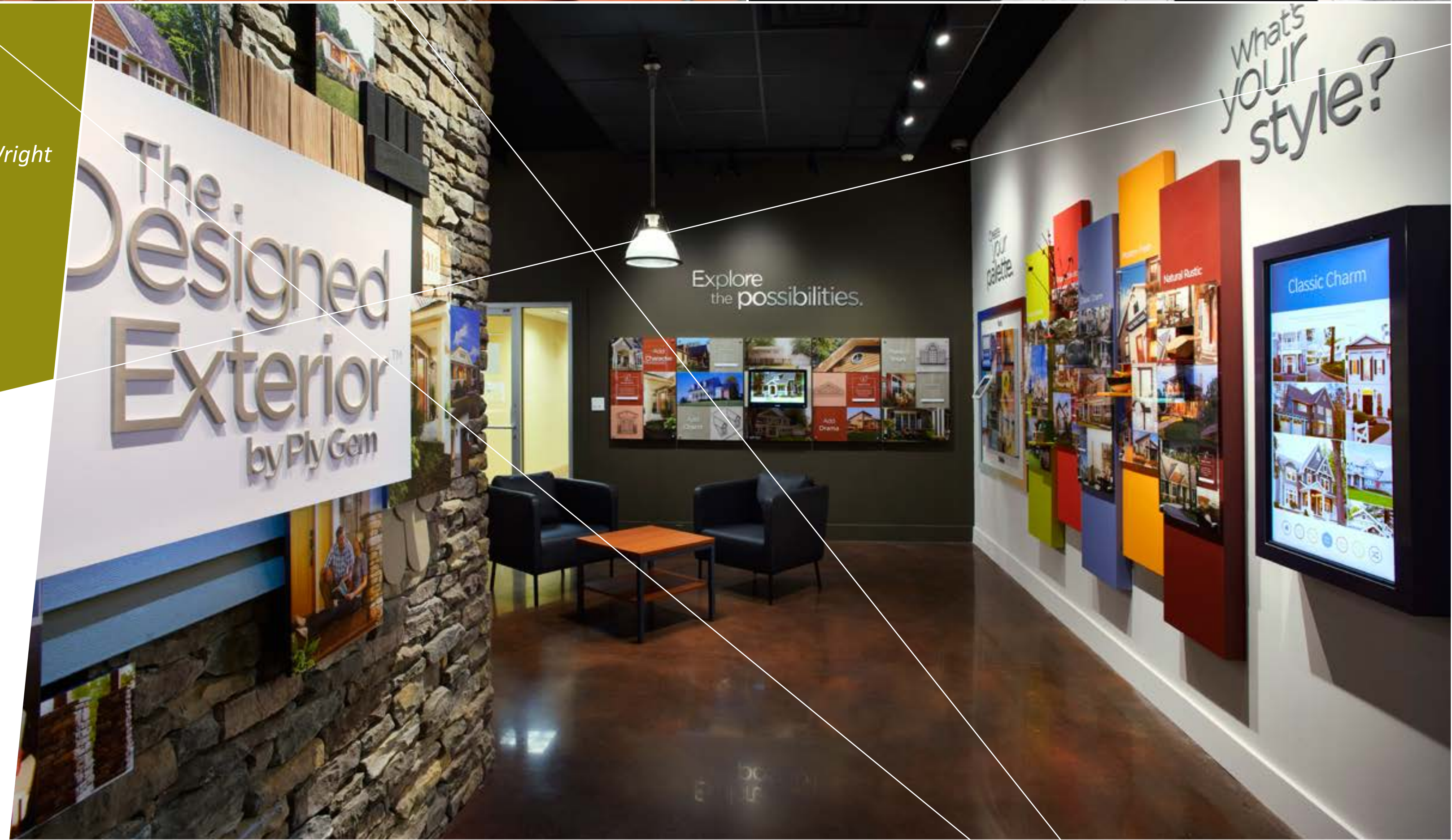
Exhibit Concepts big ideas, bigger results.

Your building is a canvas where every element should exude your brand's character and culture. Whether a lobby, showroom, briefing center, training facility, or complete interior, ECI has the experience and expertise to deliver a unique branded experience for your customers and employees alike.