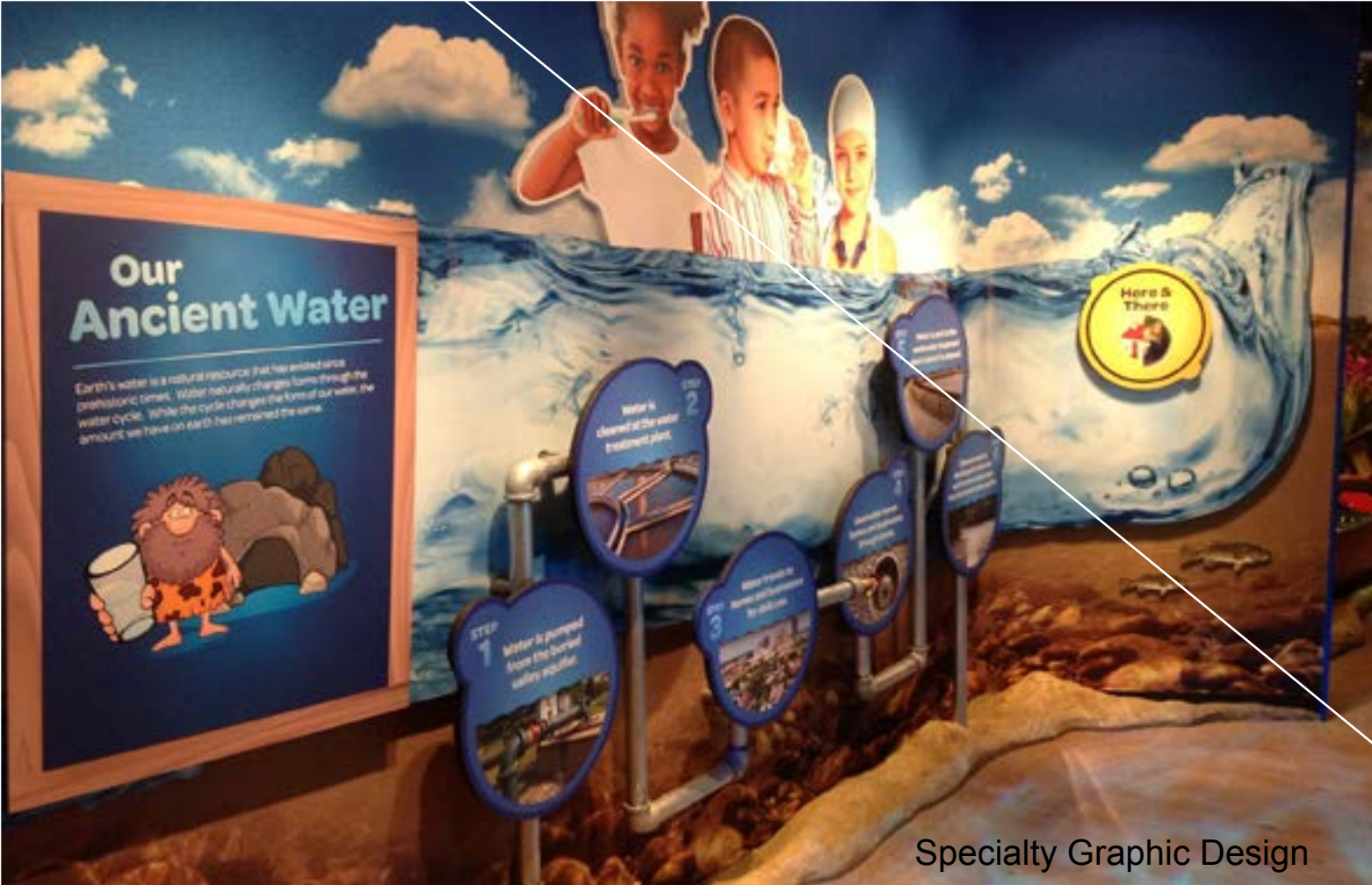
Specialty Graphic Design