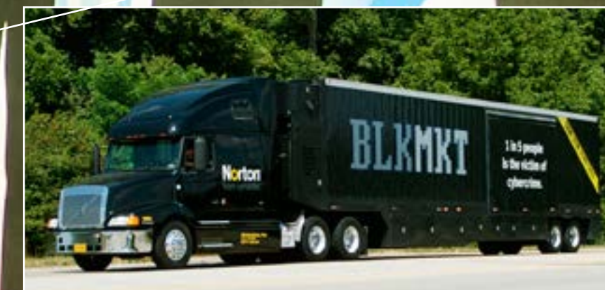
Exhibit Concepts big ideas, bigger results.