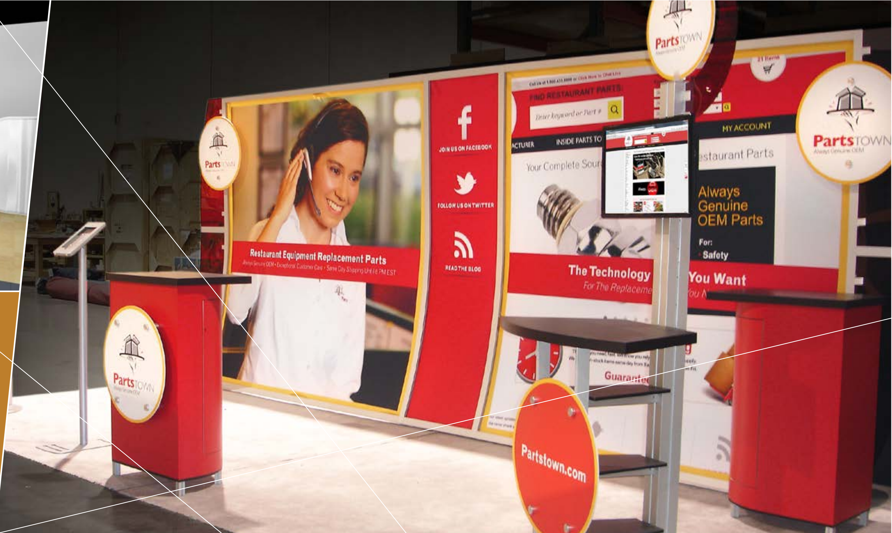
Exhibit Concepts big ideas, bigger results.

Our team of creative professionals can create an on-brand portable-modular exhibit that is far from off-the-shelf. As an authorized distributor for many quality lightweight exhibiting systems, we also offer complete program management of portable/regional programs including warehousing, graphic design, logistic and show-site services to meet any program size.