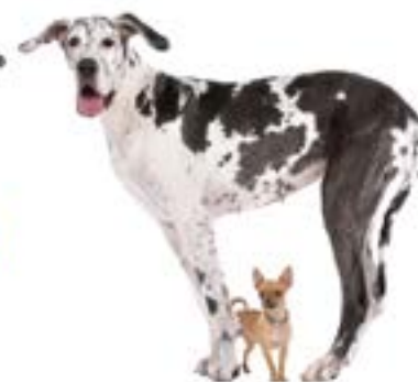
Exhibit Concepts big ideas, bigger results.

Experts in the Design, Production and Management of Branded Environments