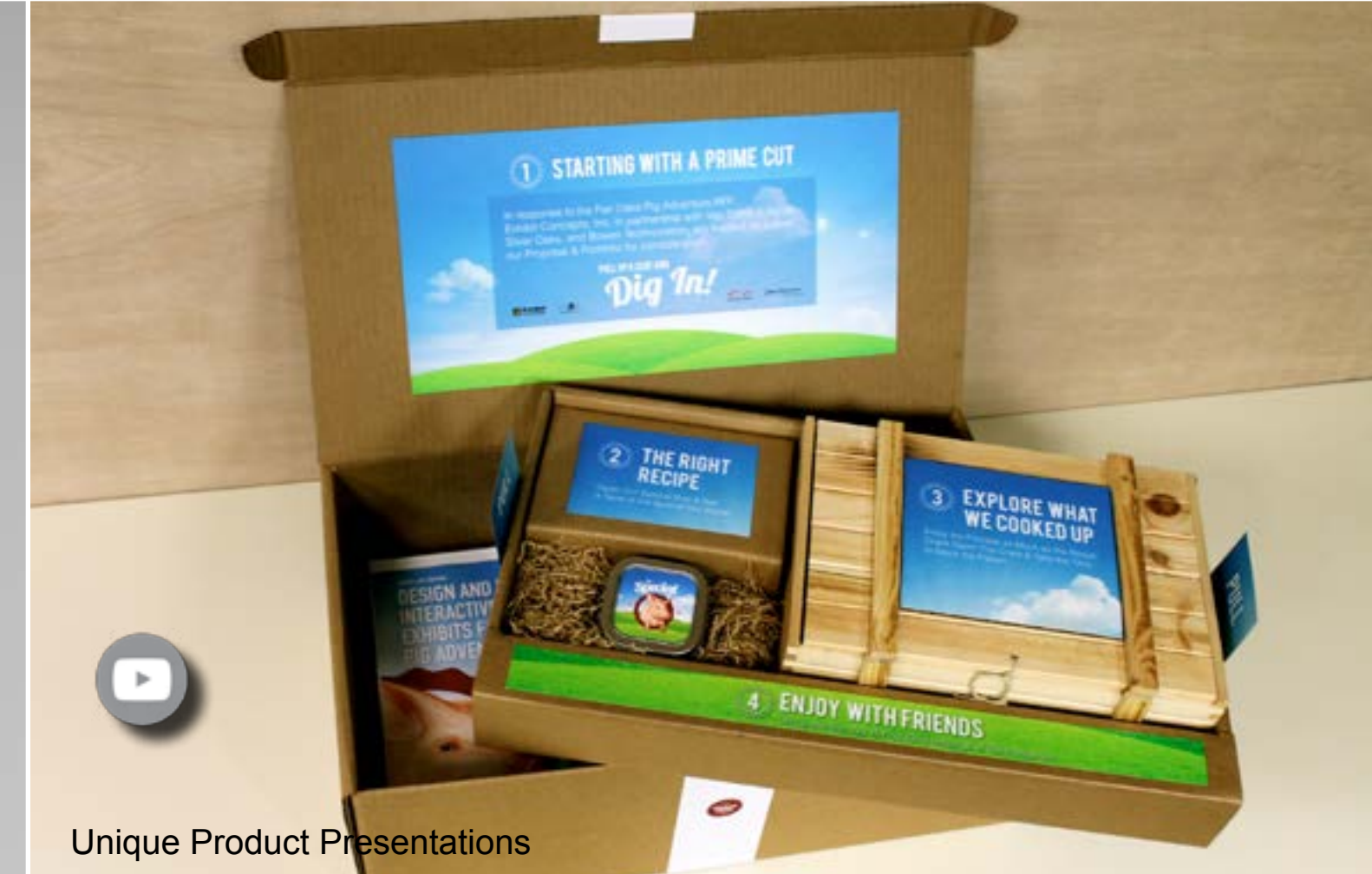
Unique Product Presentations