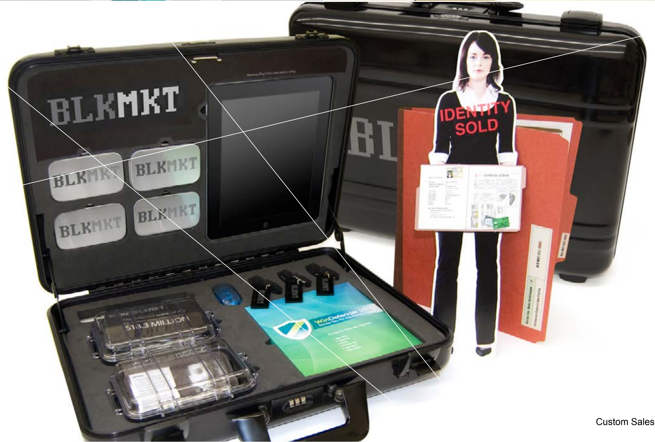
Custom Sales Kits

Experts in the Design, Production and Management of Branded Environments