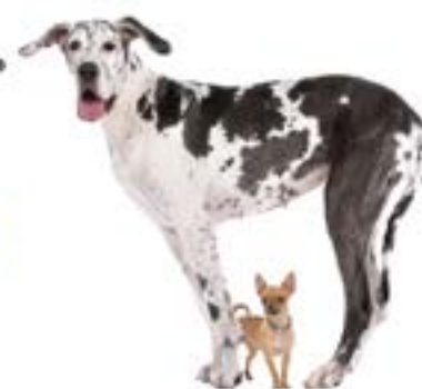
Exhibit Concepts big ideas, bigger results.

Experts in the Design, Production and Management of Branded Environments