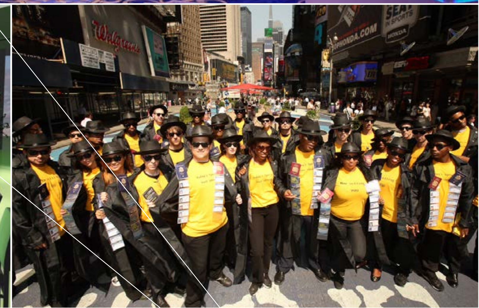
Exhibit Concepts big ideas, bigger results.