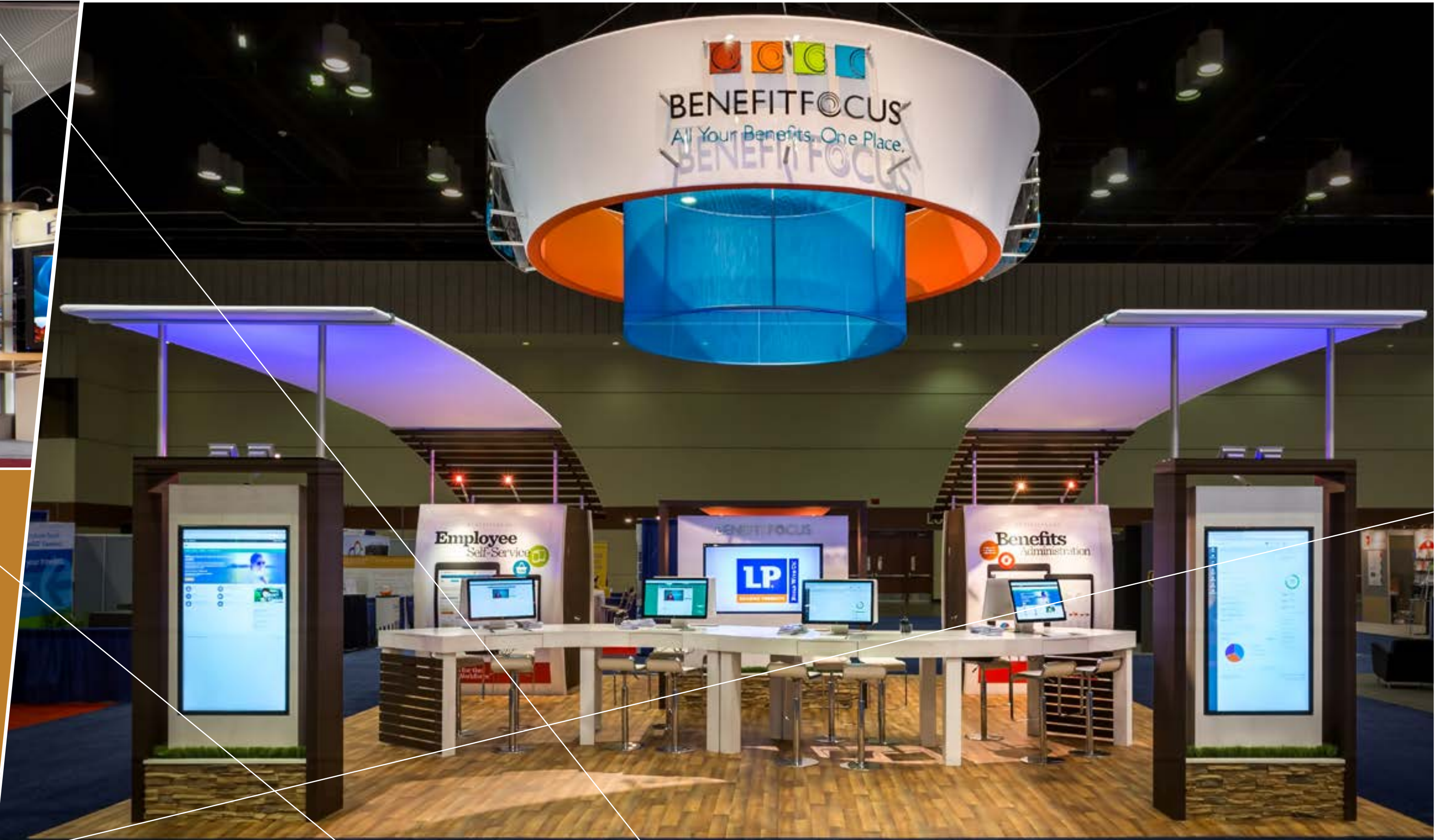
Exhibit Concepts big ideas, bigger results.

Our Design Methodology produces unique solutions to branded architecture, audience engagement, traffic-flow and functionality; all intent on capturing the essence of your brand and delivering key messages to your audience.