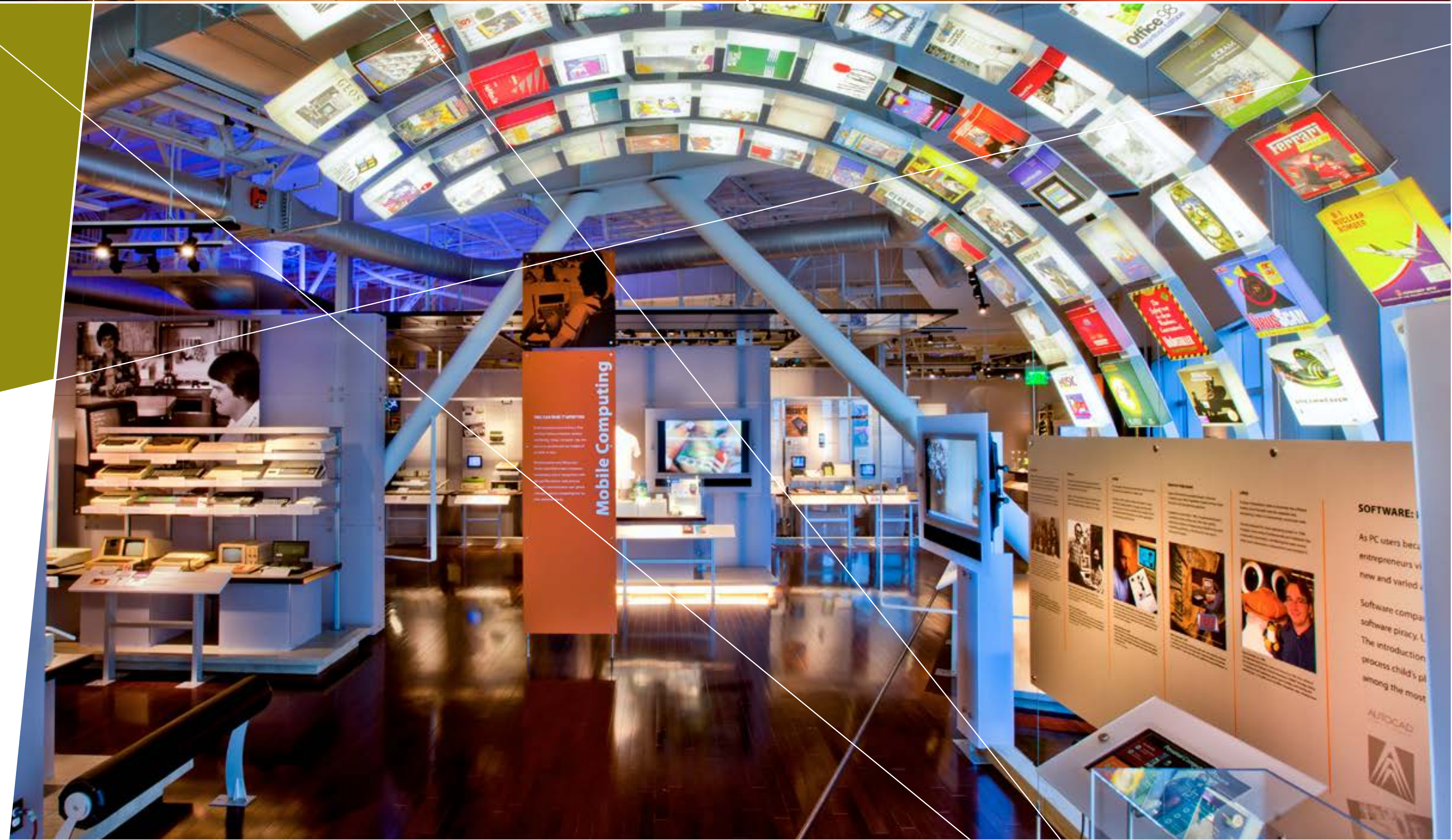
Exhibit Concepts big ideas, bigger results.

Whether a museum installation or a brand initiative, making a connection with your audience is what drives our creativity. We understand how to design experiences that provoke emotions, captivate attention and inspire action.