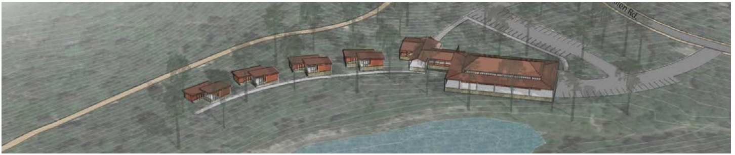
Conceptual rendering of Campsite 4 that includes lakefront views and a 300-person capacity dining room.

A great deal of thought and effort went into the vision and planning for the Centennial Fund. We established this campaign to set the course for our camp leading up to the 100 year anniversary in 2021. Often non-profits build a particular building and when completed will start a new campaign. We envisioned a deeper picture of what camp will look like and what the future infrastructure of the camp would need to be over the next five years.