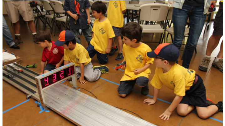
●●● 1st grade Scouts race their cars at the Pack 299 Pinewood Derby.

The races will begin at 8:00 a.m. and will end by 10:00 a.m., when the fun time activities will begin. Many of the activities will be educational as well. The funds raised from the race will benefit the