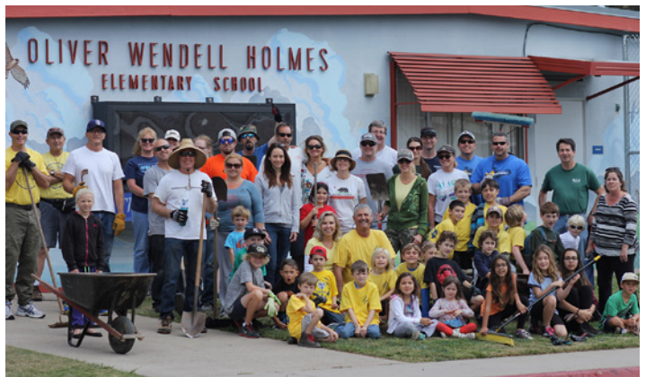
●●● More than 60 volunteers came out to beautify the Holmes campus.

Are you feeling inspired and looking for ideas for your own low water, low maintenance yard? Remember that native plants are perfect for San Diego's clay soil, harsh sun and low water climate! Some good resources to purchase native plants are at the RECON native plants: http://www.reconativeplants.com (April 18 they are having a SALE) and Las Pilitas Nursery: http://www.laspilitas.com . Some great showy and wildlife friendly plants to consider are White Sage, Black