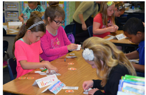
●●● Second graders work on their lesson as part of JA Day.

Campus Beautiful is a program at Holmes where each classroom is assigned an area of the school grounds where they are responsible for picking up trash and weeding every Thursday afternoon. There are student judges who check the areas cleaned. Classrooms that do a good job can earn 10 minutes of extra recess at the teacher's convenience. This program promotes school pride and responsibility.