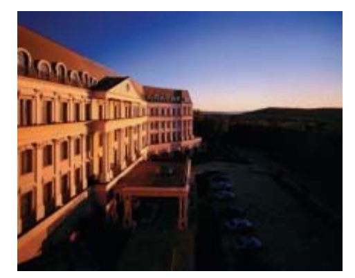
Nemacolin Woodlands Chateau