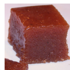
Fig Almond Cakes are made with premium whole Pajarero figs and Marcona almonds. Workers de-stem the figs by hand.