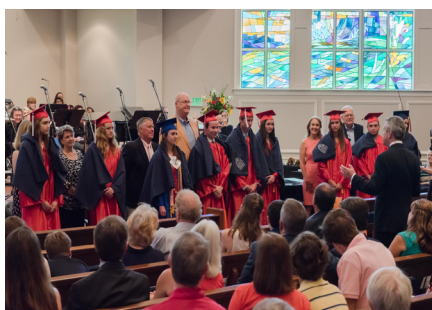
BLANKET CEREMONY 2016