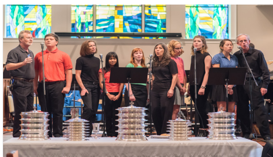
MORNING SONG AND YOUTH ENSEMBLE