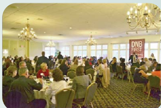
Business professionals in Chester County gather to celebrate the accomplishments of female business leaders in our community at the Annual Women-in-Business Dinner. Special thanks to our presenting sponsor, DNB First.