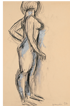
© Succession H.Matisse/ VG Bild-Kunst, Bonn 2016

Henri MATISSE (1869-1954) Sans Titre (Nu debout) 1950 Charcoal and pencil, white and grey oil paint on buff paper 51 x 32,4 cm