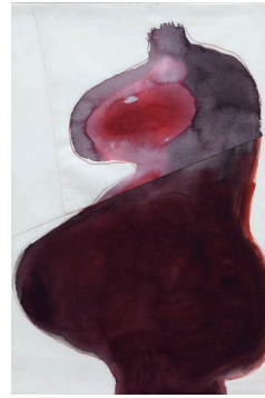
© The Easton Foundation/ VG Bild-Kunst, Bonn 2016

Louise BOURGEOIS (1911-2010) Pregnant Woman 2009 Archival dyes printed on cloth 76,2 x 55,76 cm