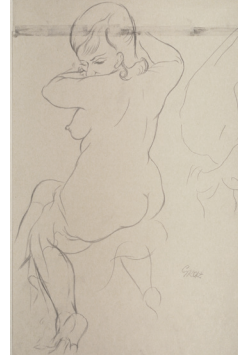
© Estate of George Grosz 2016

George GROSZ (1893-1959) Sitting female nude 1929 Pencil and carpenter's pen 50,8 x 30,4 cm