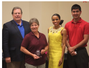
Enterprise (Golf) Award