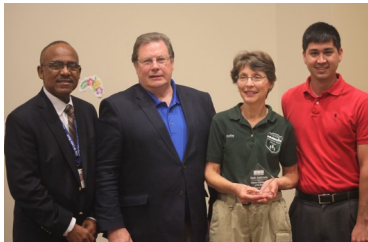
Park Ranger Award