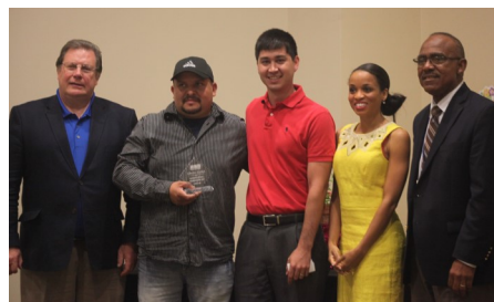
Recreation (Athletics) Award