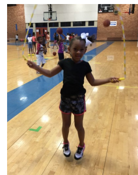
FIRST DAY OF SUMMER PLAYGROUND PROGRAM 2016!

Our Summer Playground Program kicks off this week...with almost every location at capacity we know this program is valuable and vital to the youth of our community. Program participants have field trips, sports and various activities to look forward to these next few months. Our locations this summer include Dunbar Community Center, Stephens Community Center, Romine Elementary, Rockefeller Elementary, David O. Dodd Elementary, Baseline Elementary and Henderson Middle School. It's hard to believe but this program is now going into its 96 th year! What an achievement!