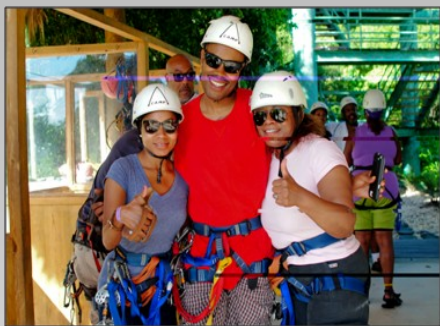
Nothing quite like a Zip Line