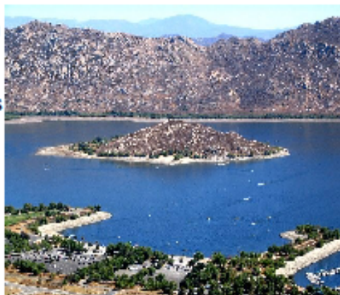
LAKE PERRIS, CALIFORNIA

Come join Four Seasons West Ski Club for a fun filled weekend of camping, biking, swimming, hiking, food, games, and roasting marshmallows by the camp fire. Bring your tents, flashlights, sleeping bags, air mattresses, bikes, and board games. If you have water toys...jet skis or boats you can bring those too! If you think we are roughing it, then think again. This is luxury camping at its best. The camp sites feature: