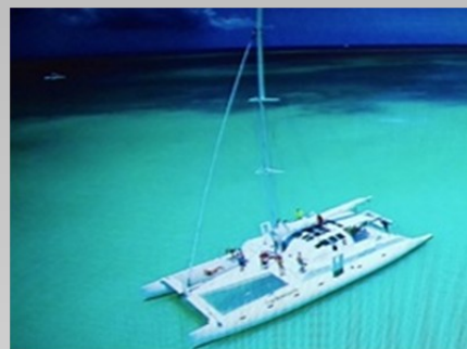
Saona Island Catamaran Excursion

YES!! We are headed back to the DOMINICAN REPUBLIC for more fun in the sun. Not to mention more gourmet foods, more cocktails, more pool party, more line dancing, more everything Caribbean. The resort and the fun is all-inclusive when you make your ALL ACCESS travel plans with 4SW and the Western Region! You know how we roll...so grab your posse and get onboard.