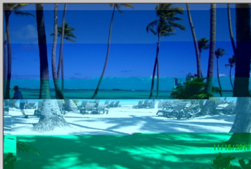
Barceló Bavaro Beach Resort Punta Cana D.R.