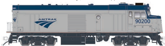
Amtrak - Phase 5