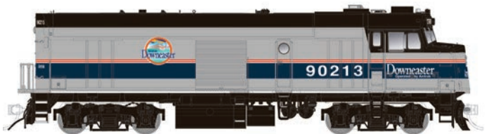
Amtrak - Downeaster