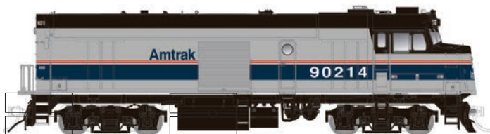
Amtrak - Phase 4