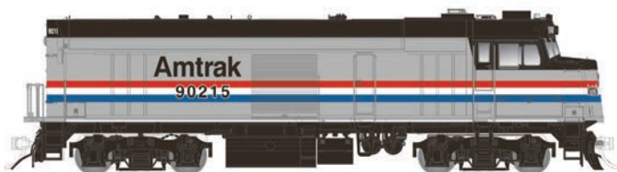
Amtrak - Phase 3

* Unlike the real Cabbage, our model is fully powered.