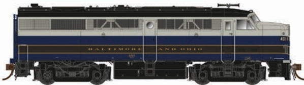
Baltimore & Ohio (1956 scheme) FPA-2 Phase Ib w/louvers in nose