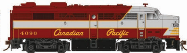
Canadian Pacific Railway (script) FPA-2 Phase II w/Farr grilles