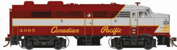
Canadian Pacific Railway (script) FA-2 Phase II w/Farr grilles