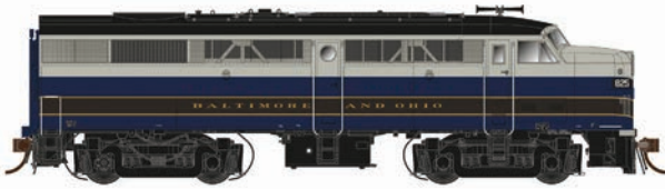
Baltimore & Ohio (1956 scheme) FA-2 Phase Ib w/louvers in nose