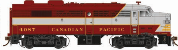
Canadian Pacific Railway (block lettering) FA-2 Phase II w/Farr grilles