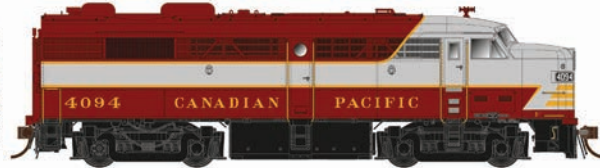
Canadian Pacific Railway (block lettering) FPA-2 Phase II w/Farr grilles