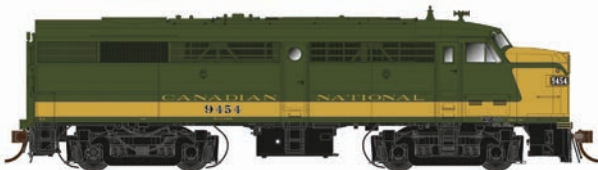
Canadian National Railways (1954 logo) FA-2 Phase II w/Farr grilles