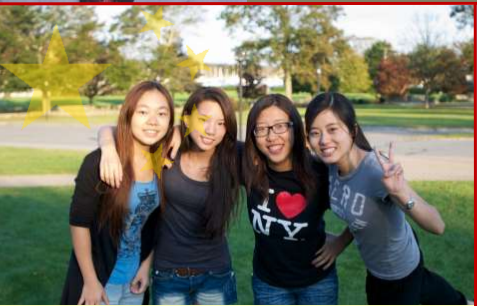
Student Accommodation Needed

To contact Claude email him at claude.hardcastle@floridaconference.com