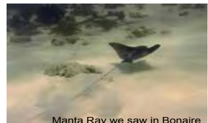
Manta Ray we saw in Bonaire