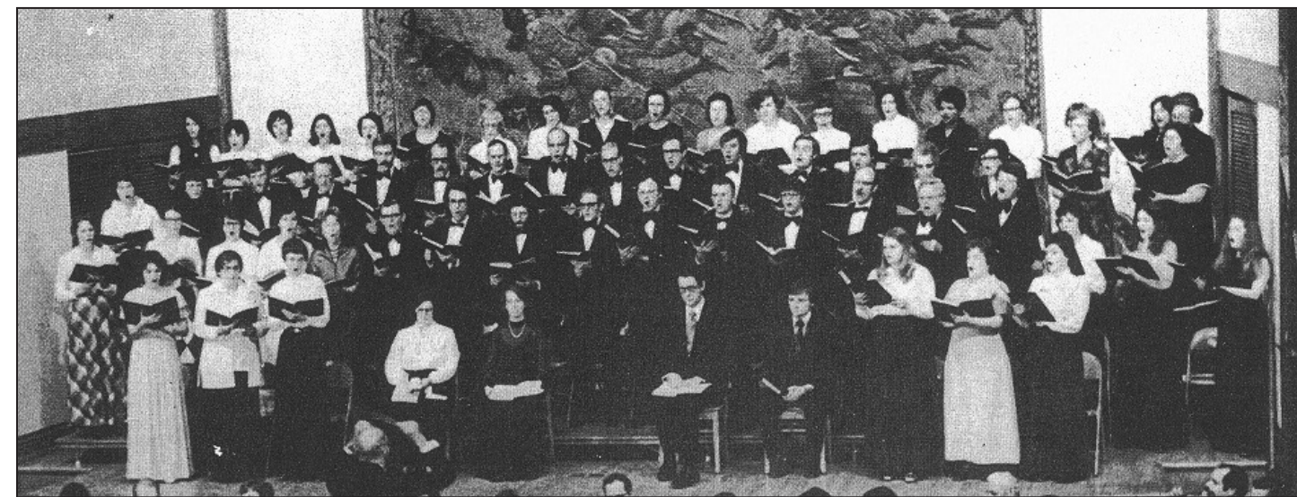
Elijah: The Rockbridge Chorus and Orchestra perform Mendelssohn's Elijah, December 12, 1976.