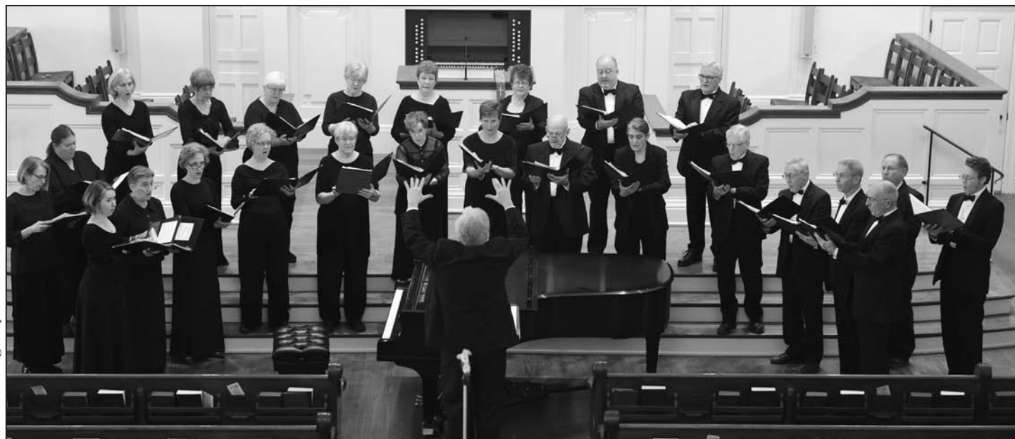
The Chamber Singers perform Poulenc and Byrd, January, 2015