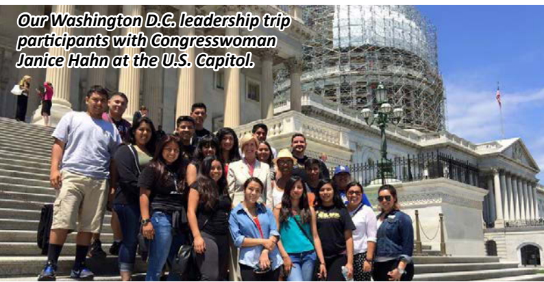
Our Washington D.C. leadership trip participants with Congresswoman Janice Hahn at the U.S. Capitol.