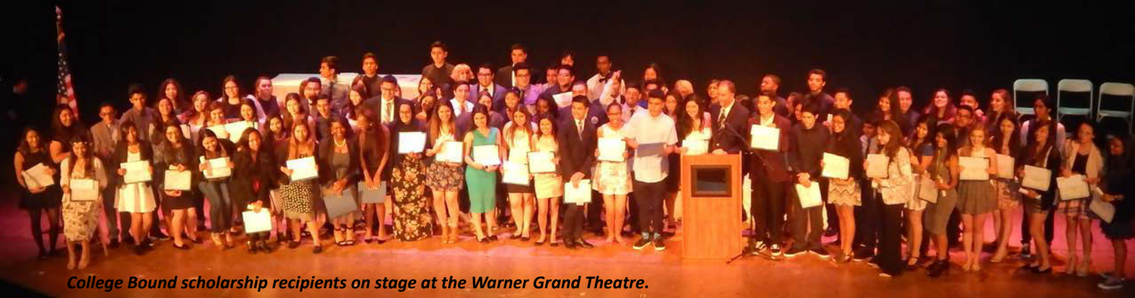
College Bound scholarship recipients on stage at the Warner Grand Theatre.