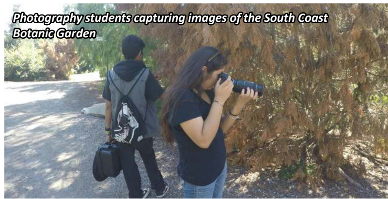
Photography students capturing images of the South Coast Botanic Garden

A t the Boys & Girls Club, there is so much to do during the summer that we don't really take a vacation. We run low-cost and free summer camps and day care at our San Pedro, Wilmington and Port of L.A. Clubhouses as well as our Harry Bridges Span School site to ensure that our youth have a place to go when school is out.