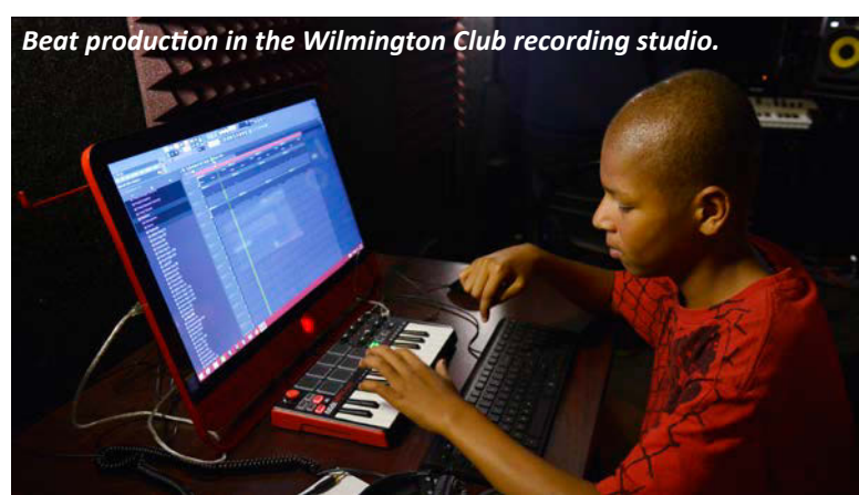
Beat production in the Wilmington Club recording studio.