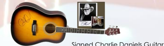
Signed Charlie Daniels Guitar