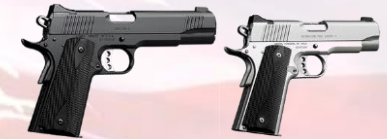
KIMBER CUSTOM II & PRO CARRY II