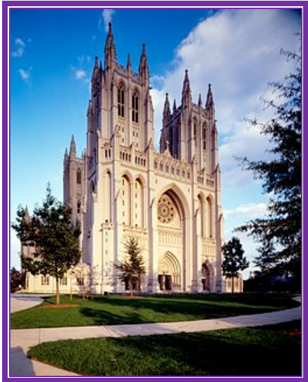
Washington National Cathedral

Please sign up on or before August 20, 2015