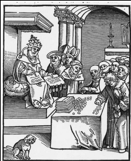
Antichristi , 1521. Lucas Cranach the Elder. A political statement by Luther's friend (and chief propagandist) on the practice of papal indulgences.