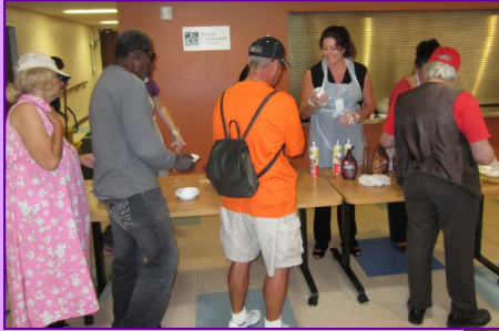
KPMG Accounting sponsors the Ice Cream Social