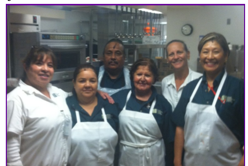
Dining Room Staff