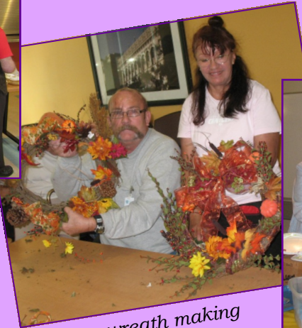
Autumn wreath making