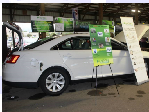
Americas AutoGas brought a vehicle to demonstrate their fuel upgrade system