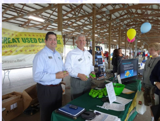
Citizens Bank threw color-changing, soft footballs into the crowd