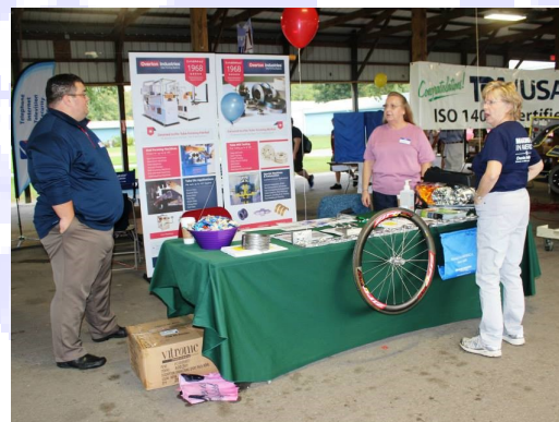
Overton Industries brought recognizable examples of their work & young employees