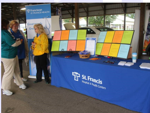
St. Francis Health handed out job descriptions with qualifications & starting salaries