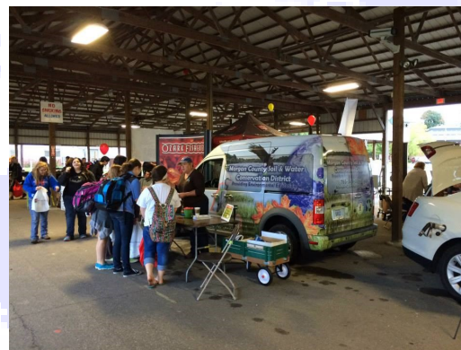
Morgan County Soil & Water brought their vehicle & gave away seed packets