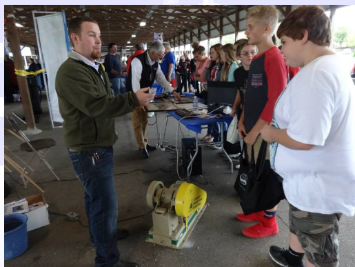
AMI sent a young engineering manager to demonstrate a crushing machine