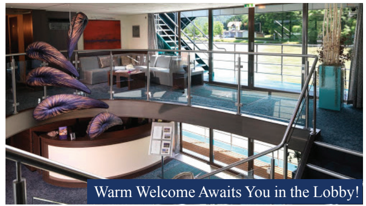
Warm Welcome Awaits You in the Lobby!