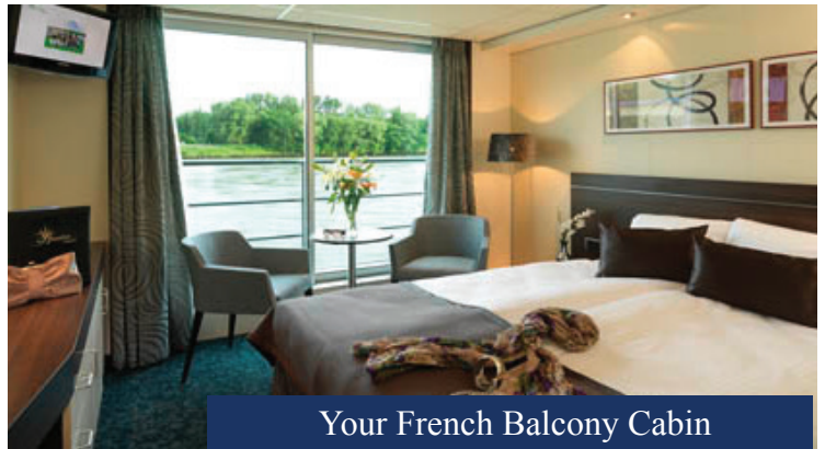
Your French Balcony Cabin