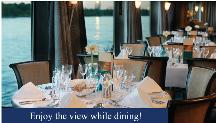
Enjoy the view while dining!