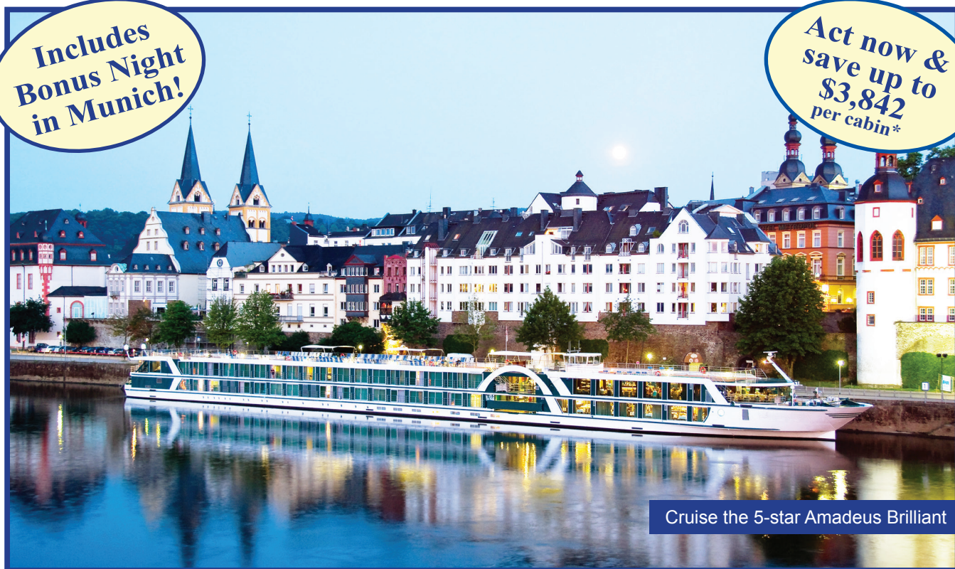
Cruise the 5-star Amadeus Brilliant