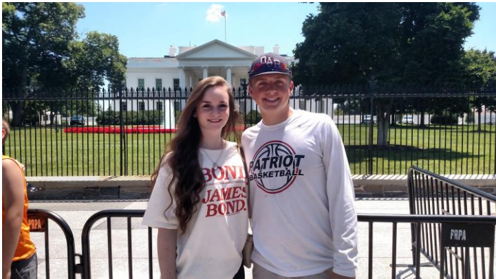
The students enjoyed visiting the monuments and other sites in DC.