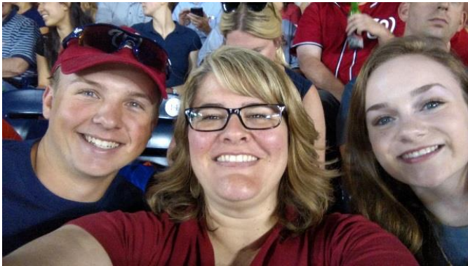
The KDS group attended a baseball game between the Washington Nationals and the Chicago Cubs.