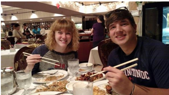
The KDS group enjoyed a fun night eating out in Chinatown.