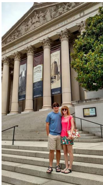
Visiting museums, monuments and memorials makes for a most memorable trip to Washington, D.C.