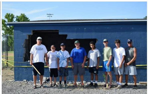
In addition to the work done by the maintenance crew, these young members of the KDS baseball and softball teams enjoyed taking part in the demolition.