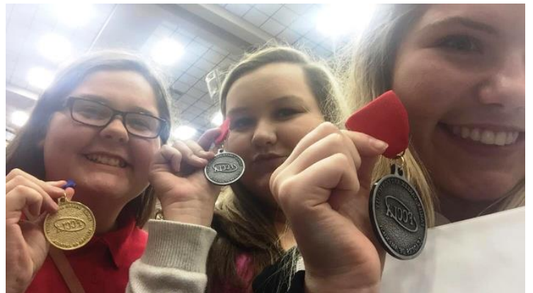
The girls proudly show off the medals they earned in the STARS competition.