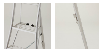
GSU model platform step spring-loaded pin

www.ChattoogaBelleFarm.com/ladders Ladders@ChattoogaBelleFarm.com