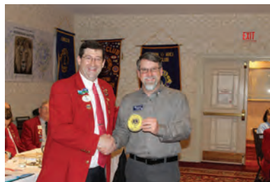
Small Club of the Year - Wakefield