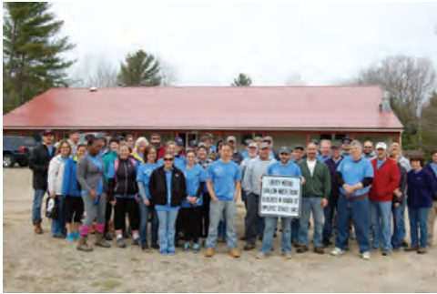
May 6 th Team