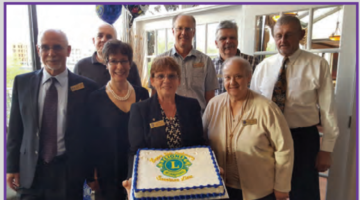
Sandown Lions celebrate serving their community for 50 years