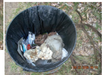
The newly donated trash can already being used to collect waste.