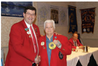
Large Club of the Year - Hudson