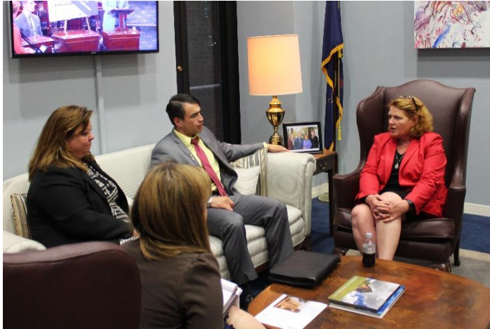
NIHB meets with Senator Heidi Heitkamp (D-ND) to discuss Tribal health and youth issues.

eager to continue leadership on this issue. NIHB commented that the proposed legislation should ensure that the MLR is enforceable and not create access to care issues in remote areas. Finally, NIHB also invited Senator Heitkamp to participate in NIHB's Youth Summit, as she is a leader on Native youth issues in Congress.