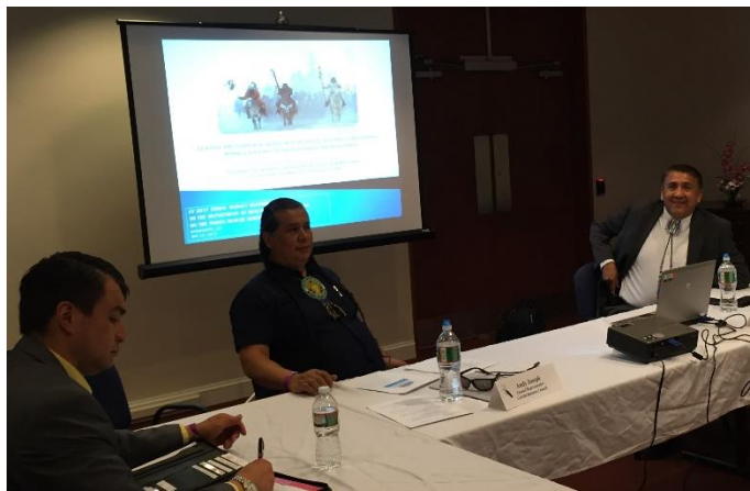
Tribal leaders present FY 2017 budget priorities to officials at the Department of Health and Human Services.