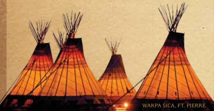
WAKPA SICA, FT. PIERRE

The ancestors of today's tribes left many artifacts and ruins behind. Resist the impulse to pick up souvenirs. Native American remains and artifacts are protected federally by the Native American Graves Protection and Repatriation Act, which carries stiff penalties.