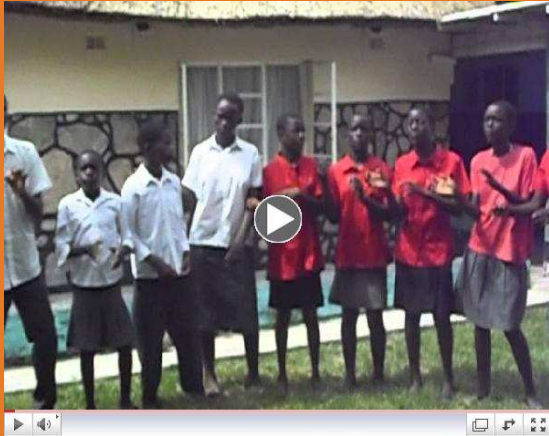
Oh Happy Day!!!

And the music in Mutoko is amazing too! Take a minute to listen to the children!