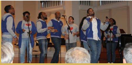
FLOW! Great young singers.