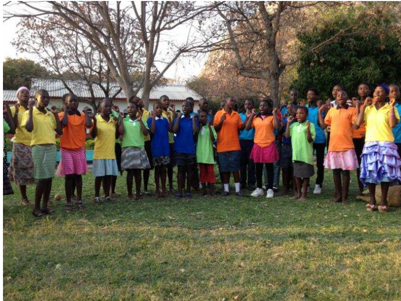
The children of Mother of Peace love to sing!