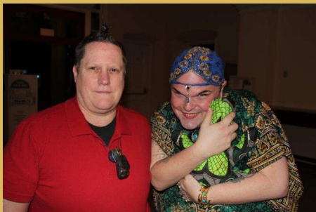
We sold every last one of the colorful, soft hippo stuffed animals that were created at MOP!