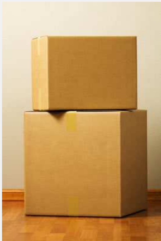
A CONTAINER CHILD IS