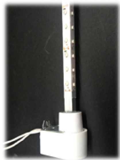
Qwik Stik 360° 4-sided, 360° emission for shallow cabinets!

*Note: For cabinet depths greater than 32" (DS) or 16" (SS), mount single sided Qwik Stiks, 12" deep and facing toward the sign face on each side of the cabinet.