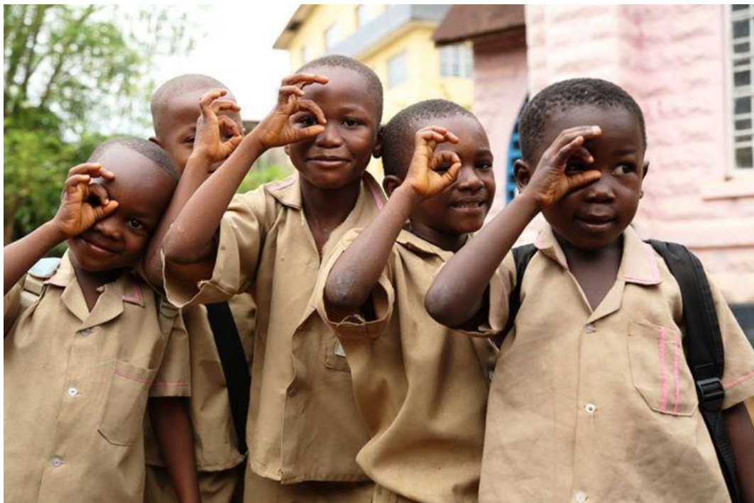
Children in Sierra Leone pledge their support for a country with ZERO preventable deaths.

17. PARTNERSHIPS FOR THE GOALS: Strengthen the means of implementation and revitalize the global partnership for sustainable development