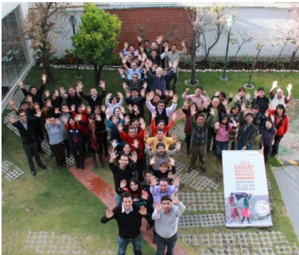
Staff taking part in a faith event in Bolivia.

Please include in your prayers your family, friends, community and State as the world's population faces problems of injustice and inequity in their daily lives. Please pray for sustainable growth and development of our nation, so that all children and their families can thrive in a safe and peaceful environment.