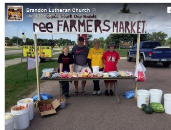
Brandon Lutheran Church about 10 mins. Mark Our Hands free FARMERS MARKET FREE Farmers Market ..... NOW @ Brandon Lutheran Church until gone!!!! #gwoh #dosomethingbc