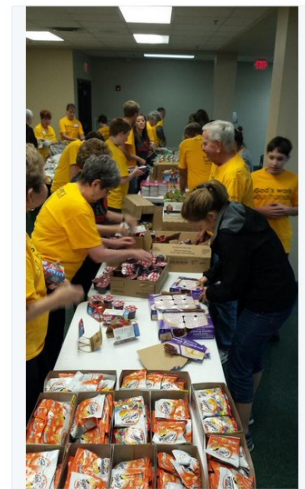
St. Mark's Lutheran @StMarkHSV Packed 200 Blessings in a backpack sacks of food plus 100 bags of food for Manna House #GWOH 1:57 PM · 13 Sep 2015