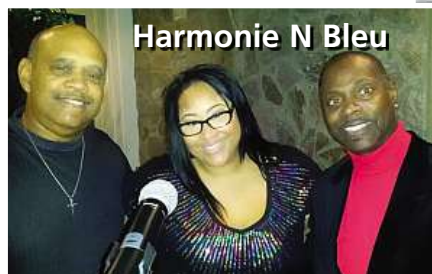
Harmonie N Bleu