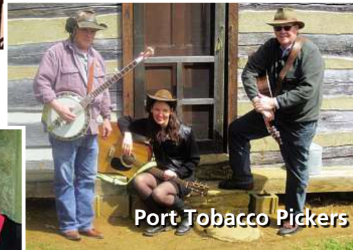
Port Tobacco Pickers