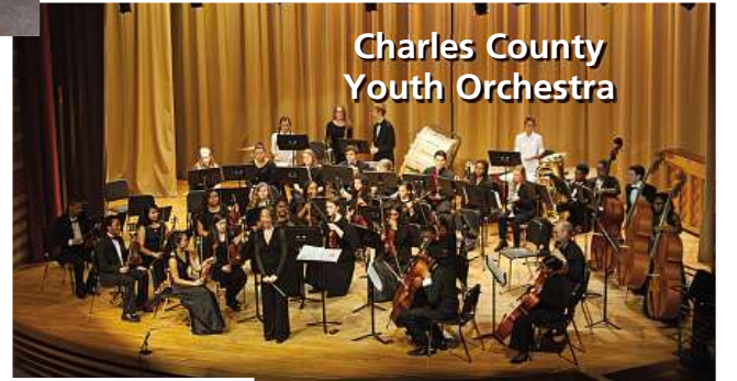
Charles County Youth Orchestra