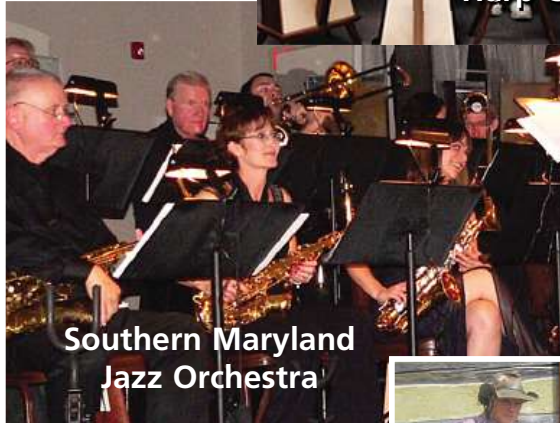
Southern Maryland Jazz Orchestra