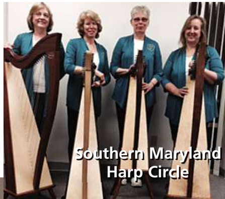
Southern Maryland Harp Circle