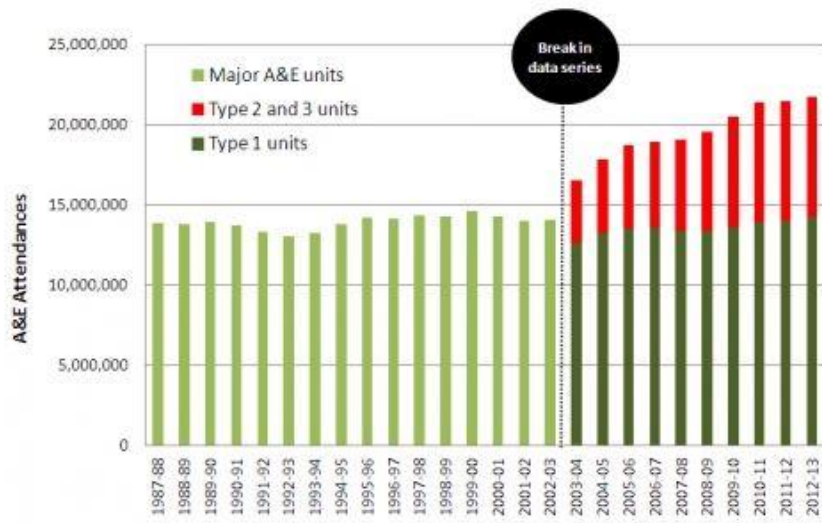
Figure 1: Annual attendances in English A&E units: 1987/8 to 2012/13