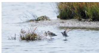
Gray-tailed Tattler '12