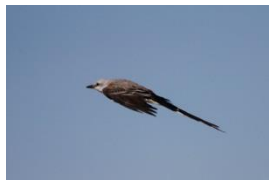
Scissor-tailed Flycatcher '11